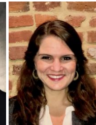
Anne Hilb Mediation & Conflict Resolution Ctr